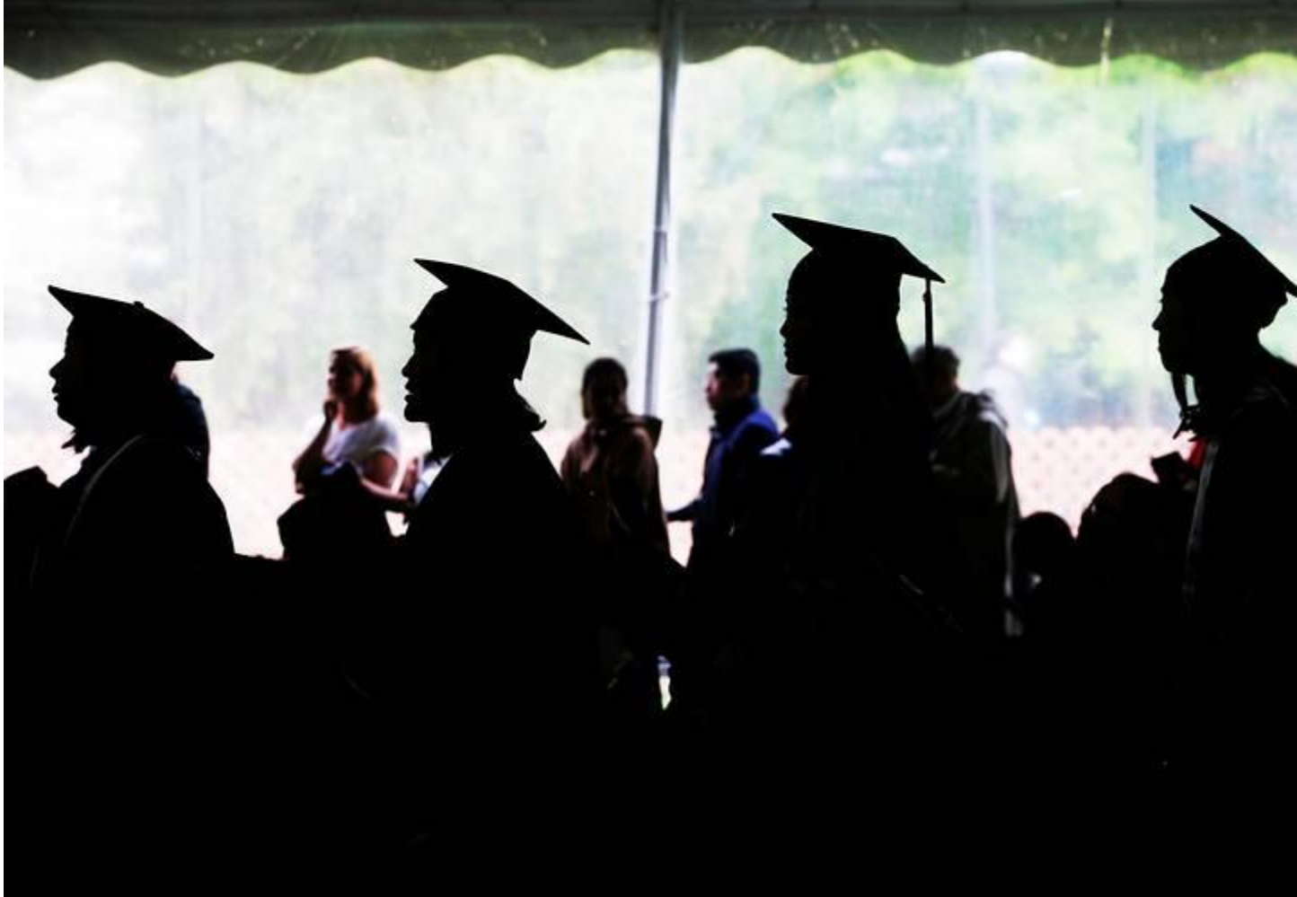
Graduating seniors line up to receive diplomas at Wellesley College in Wellesley, Mass.

After a talk I recently gave in New York, a father approached me to say that, a year earlier, his daughter was choosing between an Ivy League school and a well-known regional college that was ranked much lower. He took her to visit both schools, and on the way home from the Ivy, she told him that she was going to turn it down. She liked the people and programs at the other school and thought she would be happier there.