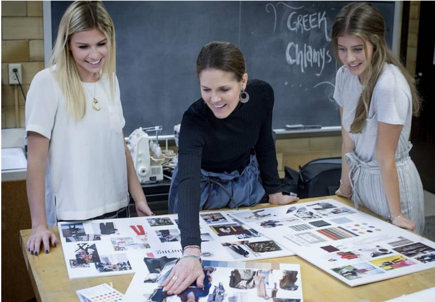
A teacher and students at St. Catherine's University in St. Paul, Minn. look over fashion posters made in class.

Today's admissions scandal should serve as a wake-up call. As a society, we need to reexamine the purpose of college and the underlying issues that lead families to be so obsessed with status or brand that they jeopardize their own children's healthy development and well-being. In surveys conducted by my group, three-quarters of high school juniors and seniors list planning for college as a top source of stress or worry in their life, well above relationships and family issues. More and more students are reporting severe sleep deprivation, anxiety, depression and thoughts of suicide as they struggle to meet the unrealistically high expectations foisted upon them. The ultimate irony is that, even when these students do end up in selective colleges, many of them continue to struggle with mental and physical health issues, and often lack the